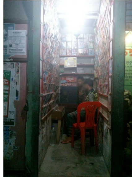
Figure 2. A computer CD/DVD shop in Dhaka. These shops often offer customers CDs and DVDs loaded with pornographic photos and videos captured with mobile phone camera (faces are blurred to preserve anonymity).

pornographic content in MMS format. At all of these sites, the hawkers informed us that the source of the pornographic content was the mobile phone repair shops at nearby repair markets, but none of them was willing to introduce us to a particular repairer who sold such content. In addition, all of the repairers that we interviewed admitted to being familiar with such incidents but denied being involved in these practices.