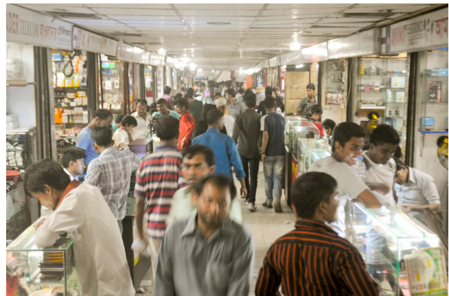
Figure 1. A busy lane in the Gulistan Underground Market on which there are many mobile phone repair stalls.

A third important community in the repair ecology of Dhaka is the community of e-waste collectors, known locally as 'Bhangari' . The Bhangari roam around the city collecting broken electronic devices (or their parts) from repair shops, offices, and individual houses. After collection, they categorize different devices or parts based on their value in the recycling market. For example, motherboards are usually sorted based on the presumed gold that they contain. Other important components of broken electronics are metals and undamaged integrated circuits. The Bhangari community that we studied was located at a narrow street connected with Elephant Road, one of the busiest areas of Dhaka, and populated with a number of computer markets and repairing shops. The Bhangaris that we studied would go to the repair shops to collect broken mobile phones and computer parts that the repairers had rejected because they were beyond repairing. The Bhangaris bought those broken devices for a nominal fee. They would then sell the components on to local and foreign e-waste businessmen. For example, some of the Bhangaris told us stories of Chinese businessmen who would often come and buy broken devices. According to the Bhangaris, these businessmen would melt the electronic devices to separate out the precious metals. The rest of the materials would then be used for producing new motherboards. Most of those recycling facilities were in China although there were also several in Bangladesh.