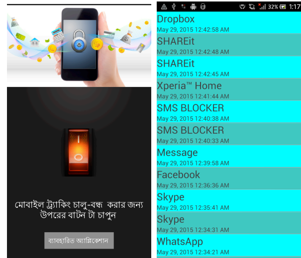
Fig 4. Screenshots of the Protiraksha application. Left: the application is prompting the user to turn on tracking. Right: the application is showing the log of timestamps for when different applications were accessed.

In the next phase of our study, we designed and developed a mobile phone application, “Protiraksha”, to explore how users would think about a software intervention to approach the problem of privacy in repair. In Bangla, the word, “Protiraksha” means “protection” or “security”. The mobile phone application was built on the Android operating system and was designed to keep track of the time at which each application on the phone was last accessed and display this information to the user.